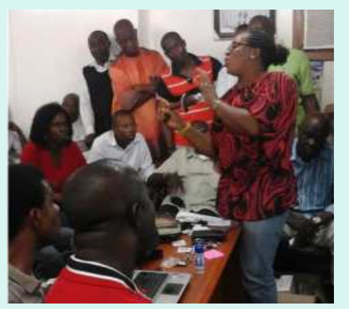
Some staff of JBN PLC at Condom Demonstration Session

took the participants through the basics